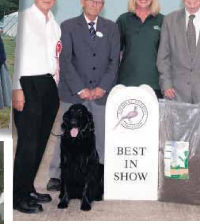
Jet's son Ch Kulawand Love To Remember.