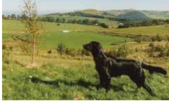
Jet was a slow maturer. Here he is pictured at 12 months.